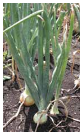
Onion thrips damage

Red onions tend to be more susceptible to thrips than white onions, with yellow onions intermediate. Resistance to thrips infestation occurs in some cultivars of Sweet Spanish onions. All cultivars can tolerate populations of 25 thrips per plant. For well-managed, irrigated onions, plants can tolerate high populations of thrips without reducing yields. Bulb size can be reduced if populations greater than 50 thrips per plant are allowed to develop and persist. In onions, waiting until you see damage is not recommended. Sprays need to be based on high populations, but before feeding damage is readily apparent. Early plantings can sometimes be harvested before damaging populations develop.