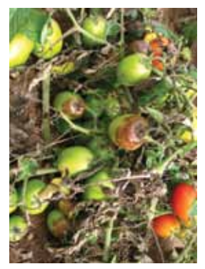
Late blight on fruit

Space plants to promote drying off of leaves and fruit; later. Support plants to keep fruit off the ground. When leaf surfaces are dry, remove and discard any blighted bottom leaves as soon as they are affected. Use appropriate fungicides when necessary. If leaf blights and fruit rots occur most years, spray with labeled fungicides when diseases are anticipated and repeat at 7-day intervals as needed. Use a pesticide that contains one or more of the following fungicide materials noted on the label: chlorothalonil, mancozeb, and fixed copper. For late blight, they must be applied before symptoms are observed. Follow the label. Remove symptomatic leaves or plant parts and kill the plant tissue by placing it in a black bag. Once the plant tissue is killed, the late blight pathogen cannot survive. Remove plants as soon as harvest is completed to reduce amount of fungal and bacterial inoculum that could be left in the soil as plant tissue decomposes.