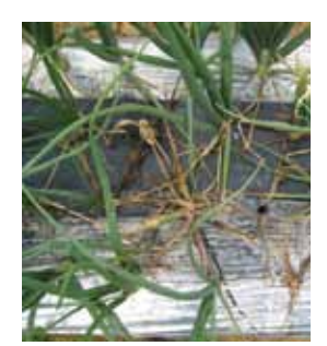
Onion bulb rot

Management: Grow bulbs in a sunny, welldrained area. Where root rots and wilts have been a problem, allow at least 4 years between onion-related plants. For storage onions, plant early enough to permit bulb maturation and drying before long, cold, wet periods in the fall. When necessary, dry onions inside before storage. When possible, grow a cultivar that has resistance to the disease of concern. Minimize any kind of injury to the plant to prevent openings through which bacteria and other pathogens can enter. Use drip or trickle irrigation when possible to minimize leaf wetness.