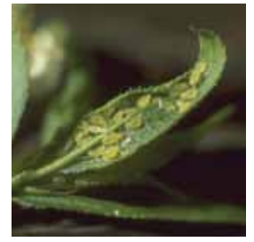
Green peach aphids