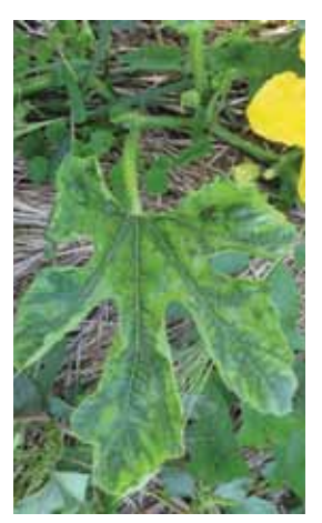
Pumpkin leaf virus

Management: This pathogen is long lived in the soil, so if it is a problem, avoid areas where cucurbits were grown within the past 5–7 years. Grow wilt-resistant melon cultivars.