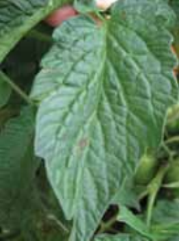
Early blight on leaf

Management: Choose a sunny planting site. Avoid garden areas where tomatoes were grown within the past few years. Ensure adequate fertility by following soil test recommendations.