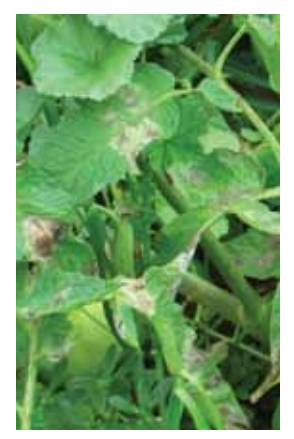
Late blight leaf lesions