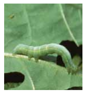
Cabbage looper larva