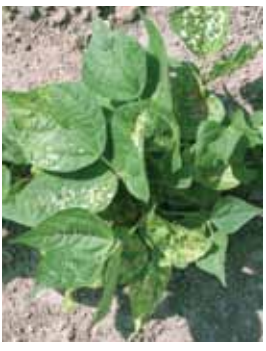
Virus on bean leaves