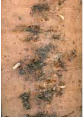
Carrot rust fly maggots

Management: Do not plant in the same location that plants in the brassica family (broccoli, Brussels sprouts, cabbage, cauliflower, kale) were grown the previous year. Avoid planting in areas that have recently decaying organic matter such as that immediately following the soil incorporation of animal manure or a cover