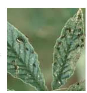
Crucifer flea beetles

Management: Clean cultivation and weed management are important since the beetles feed on many weeds. Suspending a floating row cover above the plants immediately after planting can protect them from damage. Plants with vigorous growth can withstand fairly high levels of feed-ing. Discard lightly infested leaves. When injury exceeds your tolerance, spray with an insecticide labeled to manage flea beetle on vegetables.