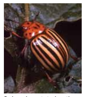
Colorado potato beetle

Management: Rotation prevents overwintering beetles from emerging directly in the fields regardless of the distance you rotate. The distance