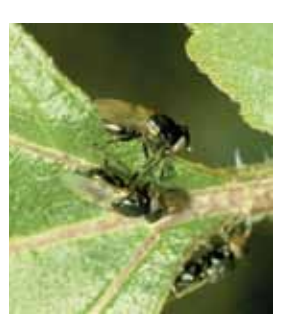
Cabbage maggot flies

Root maggots are small (½ inch), dirty white maggots that feed on the stem below ground level. When yellow rocket (mustard family) first blooms, cabbage maggot flies begin laying eggs on roots or in soil near roots. Often they girdle the stem, causing plants to wilt and often die.