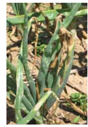
Purple blotch on onion

Management: Grow bulbs in a sunny, welldrained area. Allow at least 2 years without onion-related plants within the rotation. If needed for onions, spray with fungicides as directed on labels; fungicide materials should contain chlorothalonil, mancozeb, or a fixed copper. To be effective, start fungicide applications before disease is well established. Leaf spots and blights can be a problem where heavy dew or rainfall occurs frequently during the growing season. Use drip or trickle irrigation when possible to minimize leaf wetness. When possible, grow a cultivar that has resistance to the disease of concern.