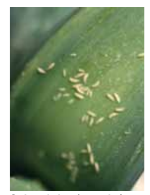
Onion thrips (nymphs)

Onion thrips occur in all areas. Adults are small (\frac{1}{25} inch long), slender, and light yellow to brown in color. They overwinter on plants or debris in gardens, fence rows, and weedy areas. Thrips puncture the outer layer of the leaves with their rasplike mouthparts and feed on sap and bits of leaf tissue. They produce several generations each summer. Hot, dry weather is favorable for increased insect activity and plant injury. Small, whitish blotches on the leaves are characteristic symptoms of thrips injury. Thrips are hard to manage since they feed between the leaves.