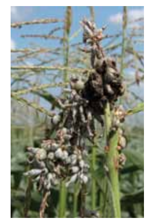
Corn smut on tassels