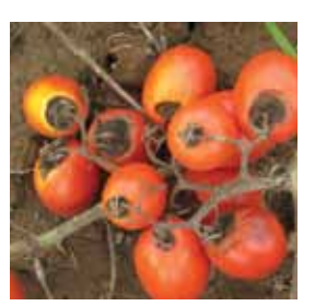
Severe early blight on fruit