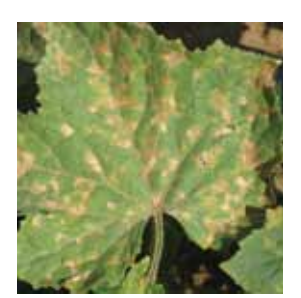
Downy mildew on cucumber

Management: Place boards on the ground near the vines to help trap adults overnight and to let you know when they are moving into a planting. Trapped adults can then be removed. Scouting is best directed toward the eggs—begin at early flowering. You can achieve control by trapping out adults, repeatedly inspecting lower leaf surfaces, and removing eggs and young squash bugs. Chemical management requires thorough coverage underneath leaves. The insects are well protected under the large leaves of cucurbits. Make sure you are not moving into canopy closure with a population of squash bugs.