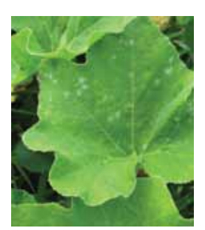
Powdery mildew on pumpkin